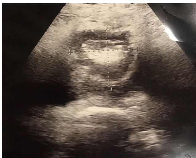
Figure 1. Pelvic ultrasound showed a complex mass lesion of 5.5 × 5 cm in the suprapubic area anterior to the bladder

Then the patient was referred to the general surgeon and admitted to the surgical ward for assessment and preparation for the operation. The hemoglobin dropped to 10.1 gm/dL, white blood cells elevated to 13.6 \times 10^9/L with neutrophilia,