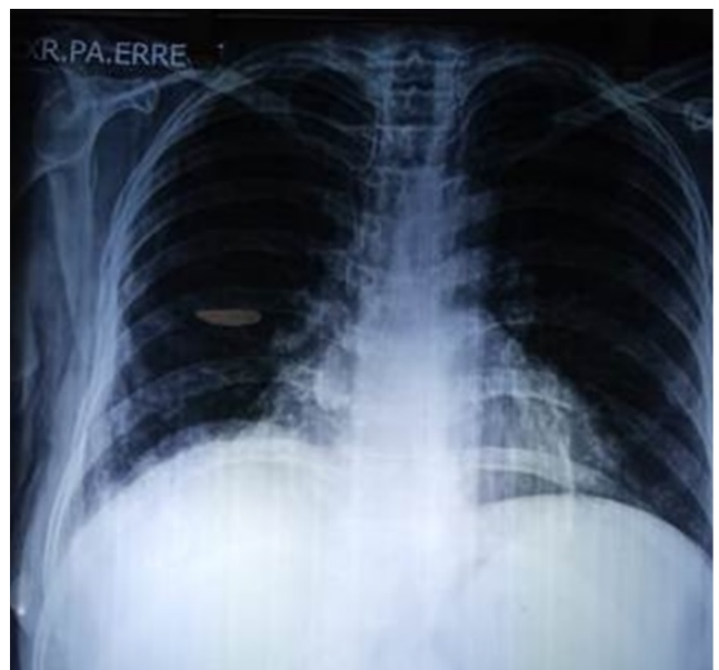
Figure 4. Chest X-ray after treatment shows complete resolution of pleural and pericardial effusions.

diogram. The patient was advised for regular long-life follow-up with intermittent courses of Albendazole to eradicate remnant hepatic cysts and prevention of the appearance of new cysts anywhere in the body. Informed consent from the patient was taken for publishing this case with its associated pictures.