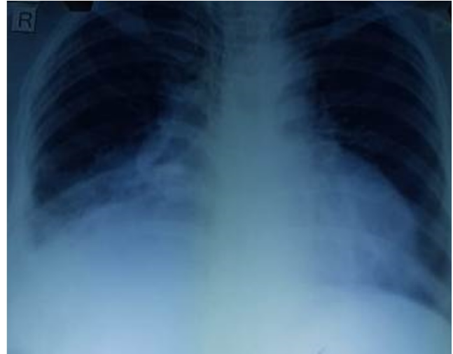
Figure 3. Chest X-ray at presentation shows right-sided pleural effusion and cardiomegaly due to pericardial effusion.